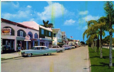
Venice Main Street 1957 (postcard)

The meeting was called to order at 4:10pm by Chair Cassell.